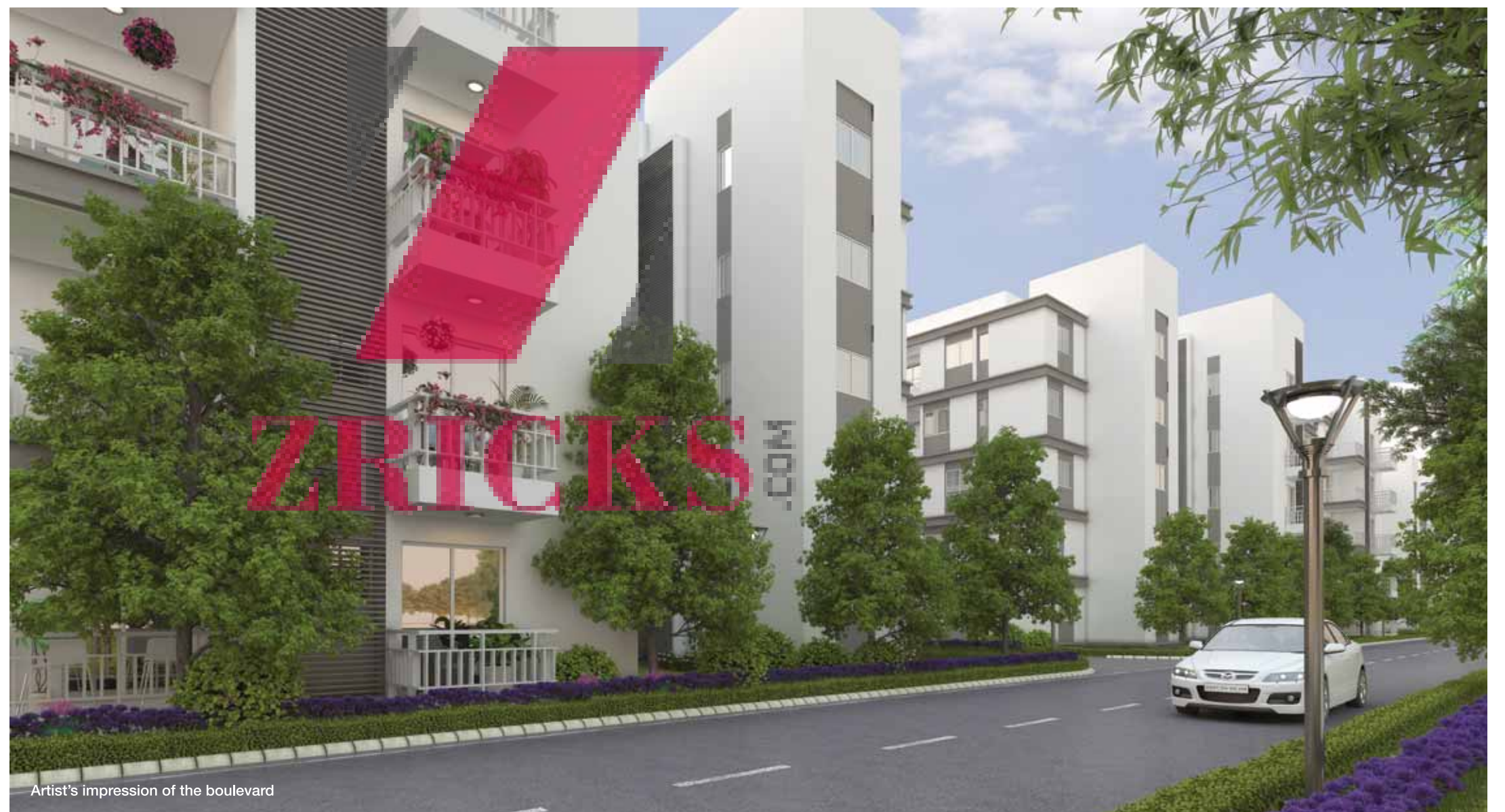
Artist's impression of the boulevard