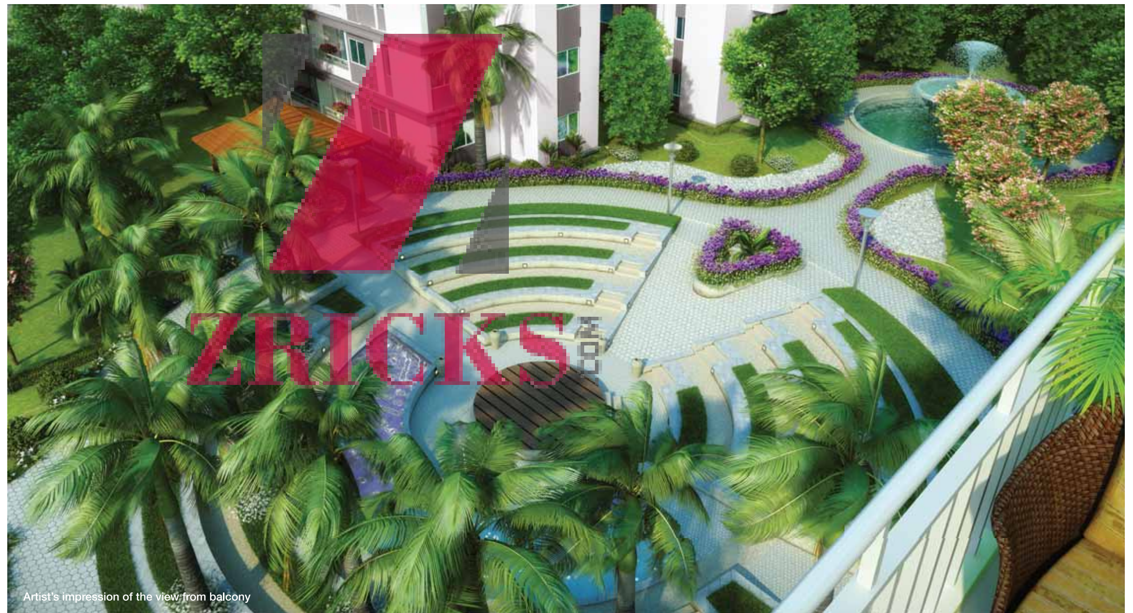
Artist's impression of the view from balcony