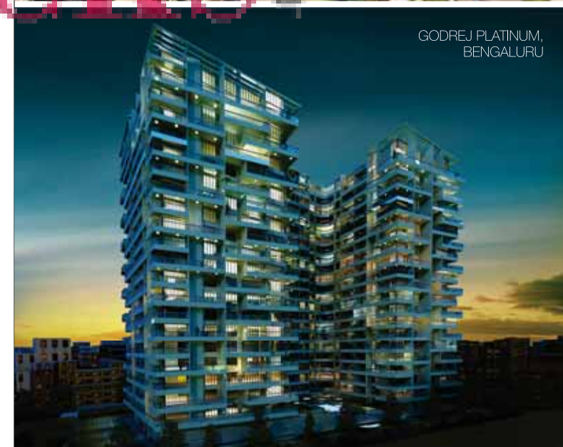
GODREJ PLATINUM, BENGALURU