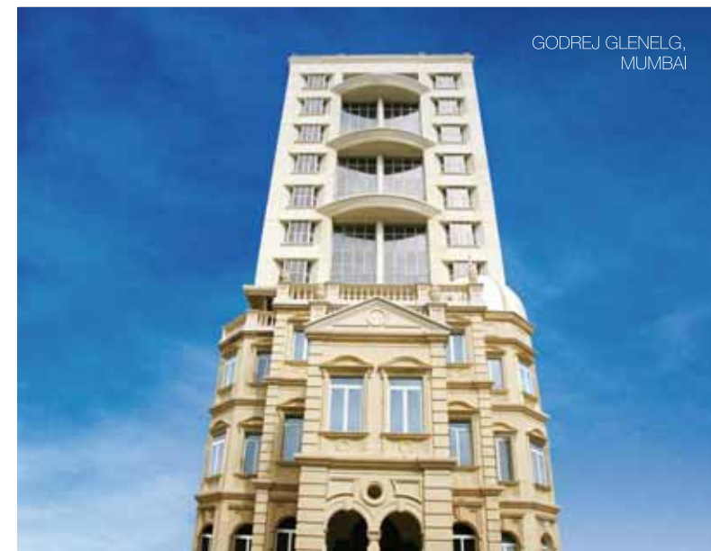
GODREJ GLENELG, MUMBAI