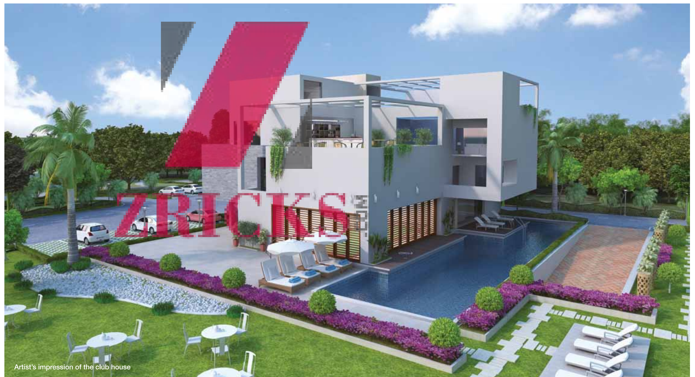
Artist's impression of the club house