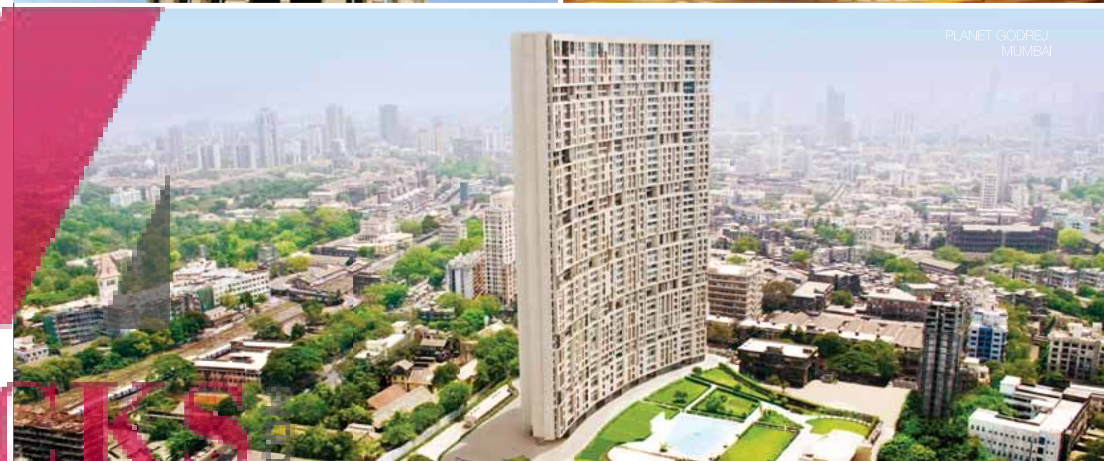
PLANET GODREJ, MUMBAI