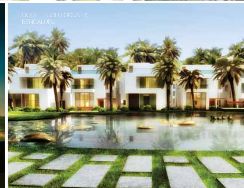
GODREJ GOLD COUNTY, BENGALURU